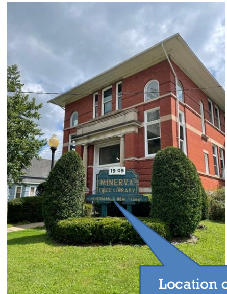
Location of new patio area as the shrubs get pulled out and new 20'x20' patio fixing drains at same time