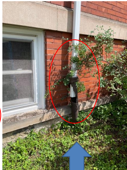
Bad Location to drain water from the roof top